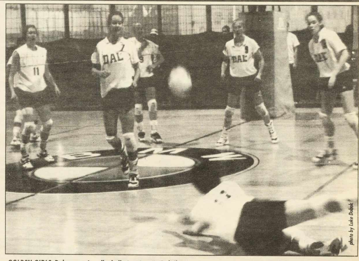
GOLDEN GIRLS: Dal women's volleyball victorious in Dal Classic.

The young squad sits 6-1 in conference action and will look to improve their standings with a match against St. FX in Antigonish on Wednesday.