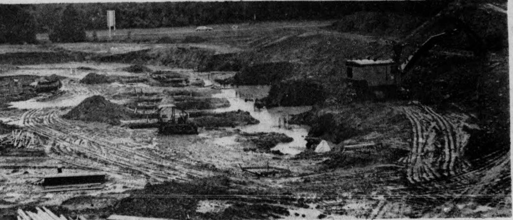
Construction on the new Aitken University Centre (multi-purpose arena) is coming along on schedule.

The construction site of the arena is located opposite Marshall D'Avray Hall and overlooks the former Teacher's College Track.