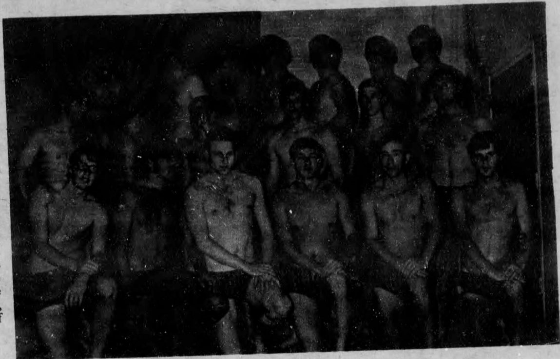
These fine specimens of the well-muscled male physique are the members of UNB's swim team - one of our few perennial winners. fountain