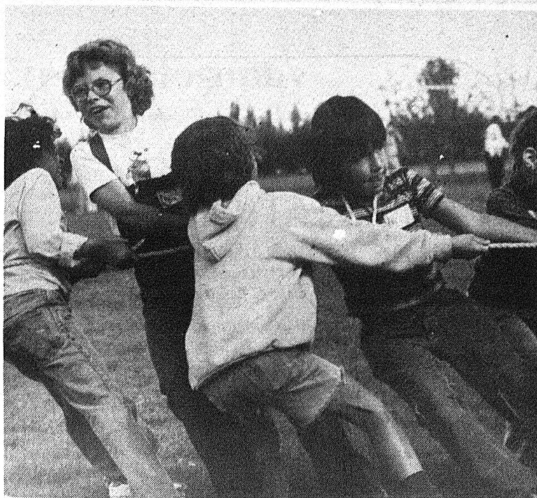
The first annual Mitchener Park Field Day last weekend entertained crowds of children and was termed a great success by parents and organizers. Mitchener Park is a residence for married U of A students.

He recently completed studies concerning the gum pad relationship in newborn infants and the physiologic reactions of young children to the dental environment.