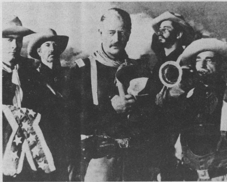
John Wayne in "Yellow Ribbon".