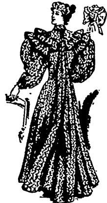
Ladies' Print Wrappers, full assortment of colors, waist lined, sizes, 32 to 42 ..... 1.25