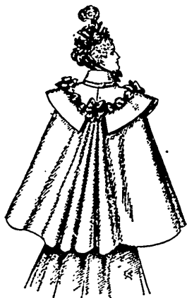
Ladies' Black Worsted Twill Cloth Capes, satin faced ..