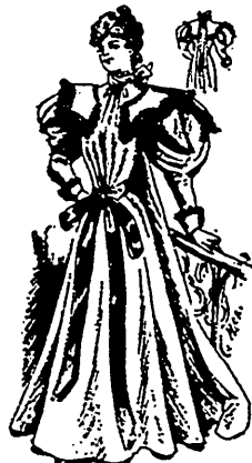
Ladies' Cashmere Tea Gown, colors, cardinal, black, navy, garnet, peacock blue, plum, and heliotrope, trimmed with gimp and lace, silk ribbon ties, lined throughout..... 6.00