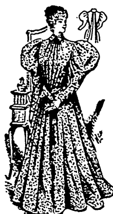
Ladies' Print Wrappers, fancy patterns, waist lined, sizes 32 to 42 ..... 1.00