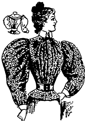
Ladies' Shirt Waists, of printed fancy muslin, white detachable collar, sizes 32 to 42, from $1.00 to ....