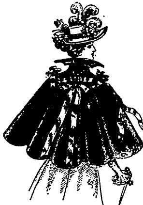
Ladies' Stylish Circular Capes, in black silk plush, satin lined ..