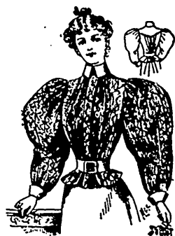
Ladies' Shirt Waists, made of percales and fancy muslins, good assortment of colors, detachable collars, sizes 32 to 42 ..... 1.00