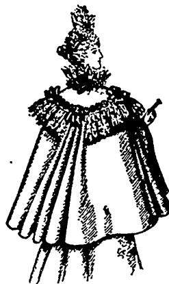
Ladies' Black Worsted Twill Cloth Capes, satin faced ..