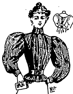
Ladies' American Percales Shirt waists, in fancy colors, detachable collars, sizes 32 to 42 ... .75