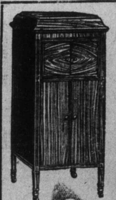
STYLE 225 In Mahogany, Walnut and Oak. Price $225.00

Mason & Risch Limited 34 King St West Kitchener