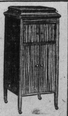
STYLE 150 In Mahogany, Walnut and Oak. Price $150.00