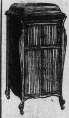
STYLE 175 In Mahogany and Oak. Price $175.00