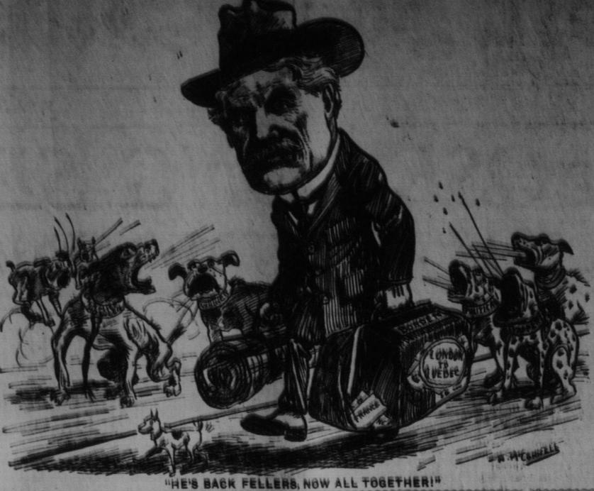
"HE'S BACK FELLERS, NOW ALL TOGETHER!"