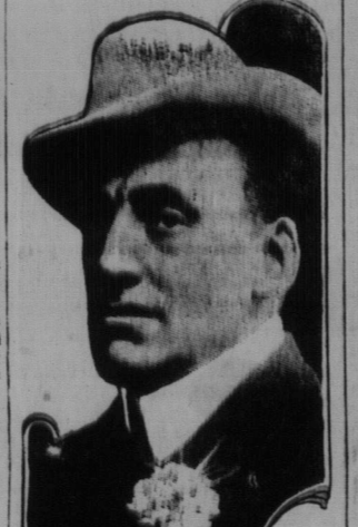
SIR E. CARSON.

(Continued from page 1) The Sinn Feiners already have announced their determination to stand aloof from such a convention, but may