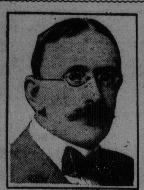
SIR ELDON GORST.

to the effect that Gorst enjoy fullest confidence of the gove