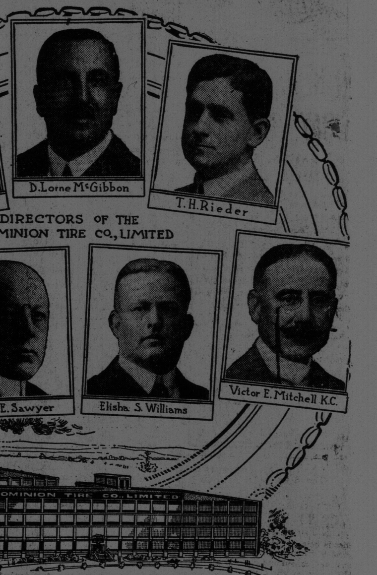
THE MILLION DOLLAR FACTORY AT BERLIN, ONT.