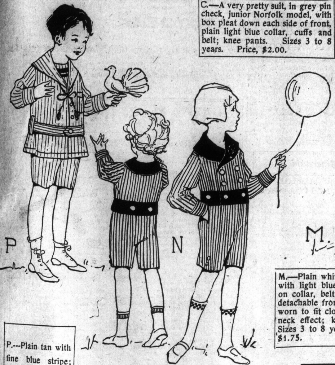
P.—Plain tan with fine blue stripe; good quality galatea, tan cord tie, small sailor collar and detachable front; knee pants. Sizes 3 to 8 years. Price, $2.00.