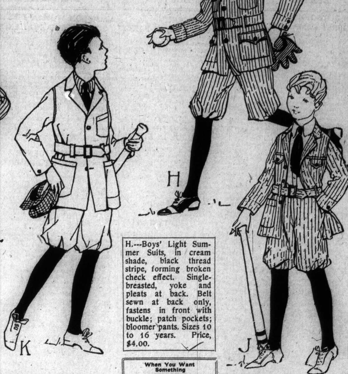
K.—Fine Palm Beach Cloth, in fawn shade, with white silk thread stripe; four patch pockets, with flaps; loose belt at waist; full fashioned bloomers have watch pocket, belt loops and button at knee. Sizes 10 to 16 years. Price, $8.50.