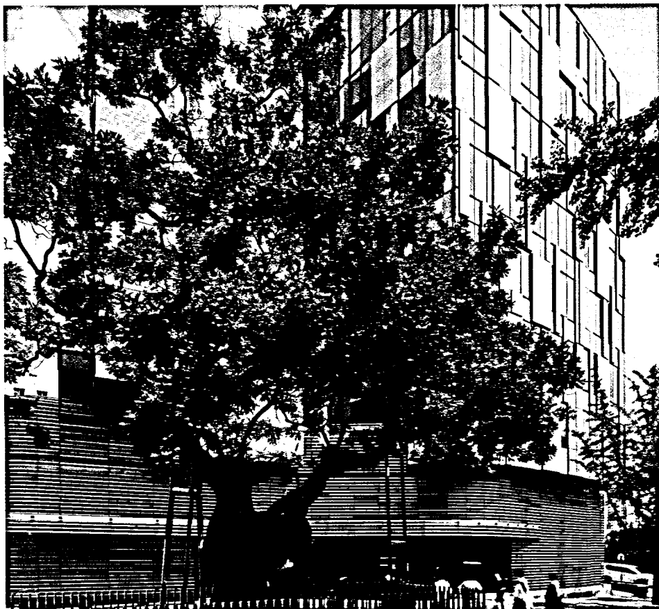
The 17-metre tall pagoda tree that stands at the foot of the new Seoul Chancery inspired the design team to adopt nature as the theme for the building.