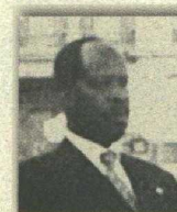
Dr. Leonardo Santos Simão, Minister of Foreign Affairs and Cooperation, Mozambique

The government of Mozambique is honoured to host the First Meeting of States Party (FMSP) to the Convention on the Prohibition of the Use, Stockpiling, Production and Transfer of Antipersonnel Mines and on Their Destruction. We look forward to welcoming the world to Maputo from May 3 to 7 for this historic meeting.