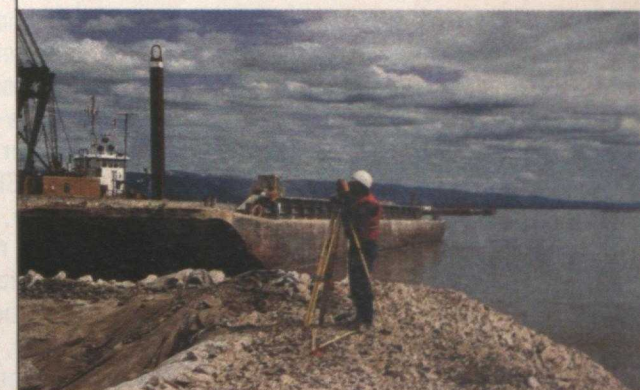
Engineering surveys for ports and harbours construction are among the services of Usher Canada Limited.

Usher Canada Limited has been providing professional surveying services to the public and private sector for 30 years. Its professional and technical staff is fully qualified through education and experience to address surveying problems within any of the following disciplines: geodesy, hydrography, cadastral and engineering surveys.