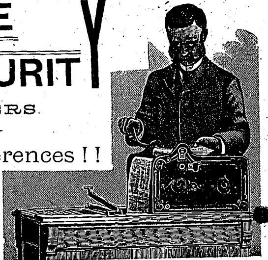
RAPID ROLLER DAMP-LEAF COPIER.

The SHANNON CABINET and RAPID ROLLER COPIER in use, afford the most perfect system for filing together Letters and Copies of answers to same.