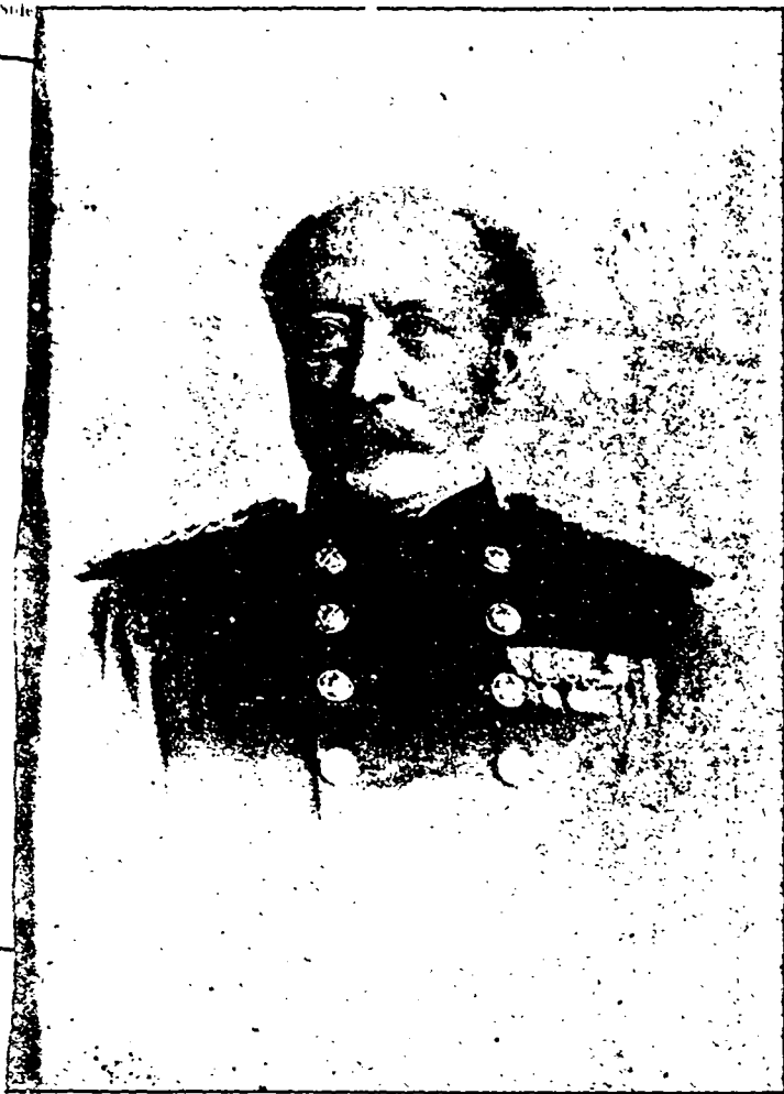
GEN. SIR JOHN ROSS.

But Halifax grew in riches and in power owing chiefly to the West Indies trade and the fondness of the negroes for salt codfish.