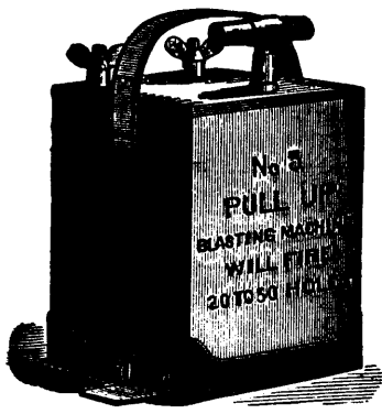
SEND FOR CATALOGUE.