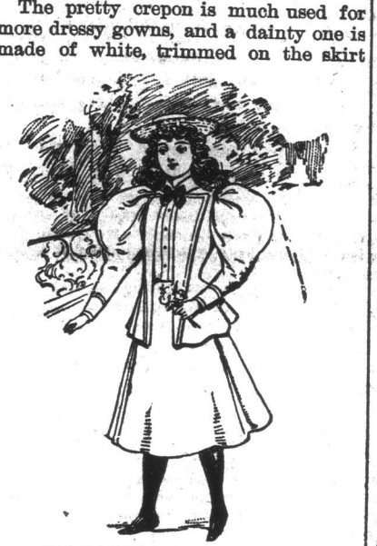
LITTLE GIRL IN TAILOR GOWN.

The "tailor made" epidemic has attacked not only the misses, but even the 8-year-old girls, and if they are really quite up to date little women they own at least one of the regulation coat and skirt gowns. The revers are not so conspicuously wide and pointed, but they are there in a modified form.