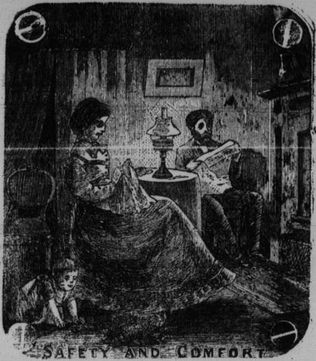
SAFETY AND COMFORT