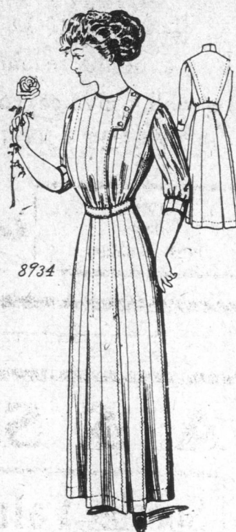
Ladies' House Dress with Seven Gore Skirt.

This design will appeal to every home dressmaker who appreciates simplicity and style. The waist has a shaped side closing, and the skirt is cut with the popular inverted back plait and has a deep tuck at each seam of the front gore. The sleeve may be finished in full length or as a shorter sleeve. The pattern is cut in 4 sizes—32, 34, 36, 38, 40 and 42 inches bust measure. It requires 7 yards of 36 inch material for the 36 inch size.