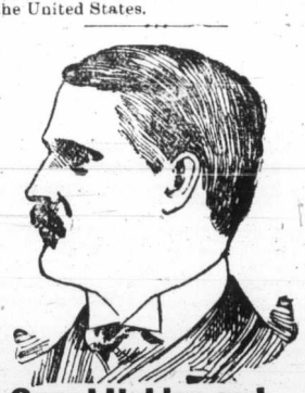
Gured Itching and