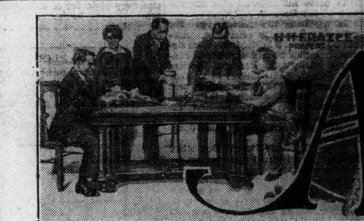
THREE SCENES FROM THE WORLD'S FUNNIEST FARCE, "A PAIR OF SIXES," GRAND OPERA HOUSE, MATINEE AND NIGHT SATURDAY, APRIL 29.

THESE BOMBS, WHICH IN APPEARANCE ARE SOMEWHAT LIKE A WATER LILY, WERE SEIZED BY THE POLICE OF NEW YORK WHEN FOUR MEN WERE ARRESTED IN A PLOT TO BLOW UP VESSELS. THE EXPLOSION OF THESE BOMBS IS VERY GREAT, AND IF TWO OR MORE WENT OFF ABOARD THE SAME VESSEL THE FORCE MIGHT BE SUFFICIENT TO BLOW OUT THE SIDE PLATES AND CAUSE THE VESSEL TO SINK.