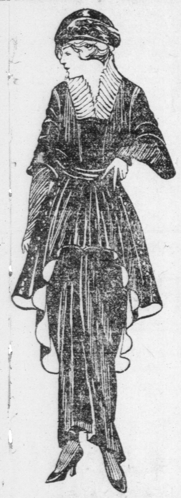
An Effective Model

tunic, also of the violet, is long in the effect. back and reaches just above the knees It topped an evening gown that was in front; but there is no abrupt slope as dainty and simple as a water lily and no distension at the edges. which some way it seemed to suggest. The skirt of pale green charmeuse was