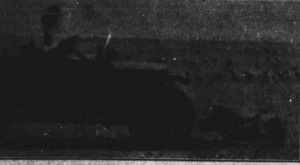
Enraged Warthog Turns on Pursuers

FORDS USED TO HUNT BIG GAME IN AFRICA The street of the description of the other hand, shows a discouraging tendency to dissolve in the developing process when high temperatures maintends.