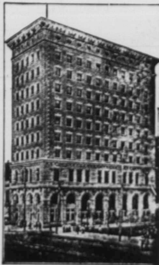
Union Bank Building, Winnipeg.

MANITOBA—Balcarres, Birtle, Boissevain, Brandon, Carberry, Carman, Carroll, Clearwater, Crystal City, Cypress River, Dauphin, Deloraine, Glenboro, Hamiota, Hartney, Holland, Killarney, Manitou, Melita, Minnedosa, Minto, Morden, Neepawa, Newdale, Nings, Rapid City, Roblin, Russell, Shoal Lake, Souris, Strathclair, Virden, Waskada, Wawanesa, Wellwood, Winnipeg, Winnipeg (N.E. Br.), Winnipeg (Sargent Ave. Br.), Winnipeg (Logan Ave. Br.), Winnipeg (Selkirk and Salter Streets). SASKATCHEWAN—Adanac, Arooka, Assiniboia, Barchanaw, Carlyle, Craik, Cupar, Esterhazy, Eyebrow, Fillmore, Gull Lake, Humbolt, Indian Head, Jansen, Kindersley, Kerr Robert, Landis, Lang, Lanigan, Lemberg, Lumsden, Luss, Lund, Macklin, Maple Creek, Maryfield, Milestone, Moomin, Mousam, Nether Hill, Neudorf, Outlook, Oxbow, Penae, Perdue, Qu'Appelle, Regina, Rocanville, Rosetown, Saskatoon, Scott, Sinitaluta, Sutherland, Strassburg, Swift Current, Teasdale, Theodore, Togo, Wapella, Watrous, Webb, Weyburn, Wilkie, Windhorst, Wolseley, Yorkton, Zealandia. ALBERTA—Airdrie, Alix, Barons, Bassano, Blairmore, Bowden, Brooks, Calgary, Carbon, Cardston, Carleton Place, Carstairs, Claresholm, Cochrane, Cowley, Didsbury, Edmonton, Ft. Saskatchewan, Frank, Grassy Lake, High River, Innisfail, Irma, Irvine, Lacombe, Langdon, Lethbridge, Lethbridge (North Ward Branch), Macleod, Medicine Hat, Okotoks, Pincher Creek, Seven Persons, Sterling, Strathmore, Three Hills, Wainwright.