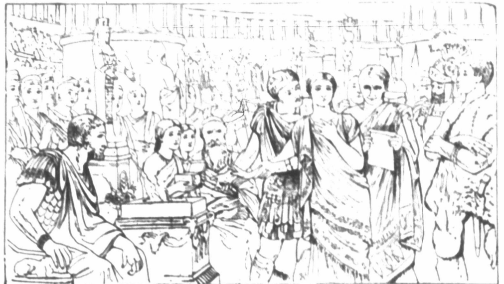
"DIANA OR CHRIST."—Size 28 x 22 inches.

WE have secured a limited number of beautiful tinted engravings called "Diana or Christ," and "Not to be Caught with Chaff," exact reproductions of the famous original paintings. To any one who will send us $1.50 we will send the