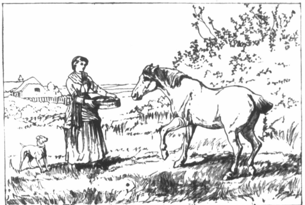
"NOT TO BE CAUGHT WITH CHAFF."—Size 28 x 22 inches.

One year to any address and the choice of either picture, post paid. This offer is extended to all our subscribers, renewals as well as new names. Subscribers whose subscriptions have not expired, or those recently renewed, are privileged to accept this great offer, in which case their term of subscription will be extended one year.