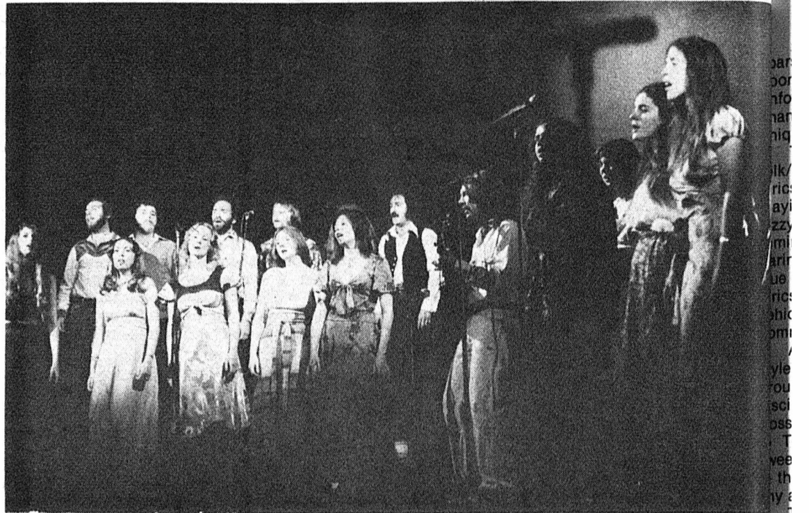
Do these upstanding folks look like the type that would burn the Chamber of Commerce down?

Thought maybe then these chaps were protesting the pro worker — pro socialist content of the words being sung. It couldn't have been the music, because the music was the down home footstompin' kind of stuff. THEN SUDDENLY IT DAWNED ON ME THESE GUYS BOOING AND HISSING HAD ACTUALLY