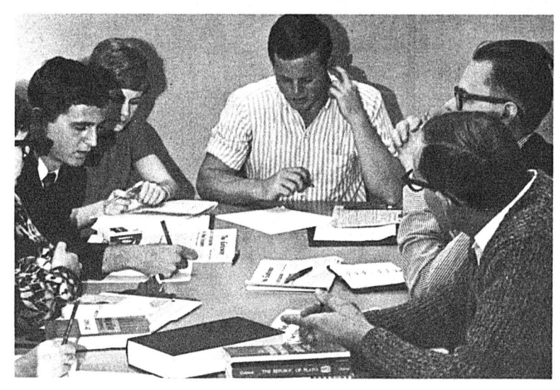
PROBLEMS, PROBLEMS, PROBLEMS ... announcing the NDY boycott of Model Parliament

set up to review students' union fees, following a petition by medicine and dentistry students in September for reduced fees for their faculties.