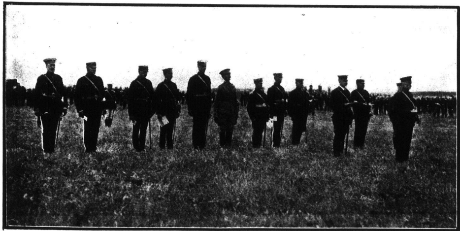
Col. Cruikshank and officers at Church Parade

turnout is remarkable as a proof of the rapid settlement in the west and it is worthy of thought that so many men fully equipped and well mounted are trained annually on a camping ground which only a decade ago was considered an open range for cattle.