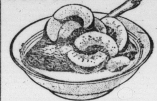
Made in Canada.

Shredded Wheat Biscuit is the ideal food for youngsters to study on or to play on because it contains the life of the whole wheat grain in a digestible form. The kiddies like it with milk or cream, with sliced bananas or other fruits.