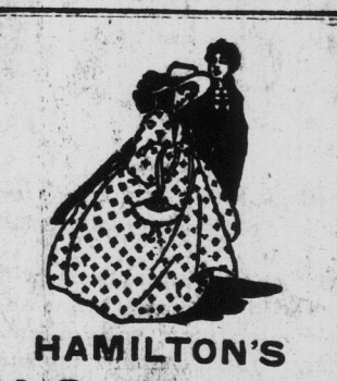
FIG BARS Just taste that filling of real Smyrna fig jam!

R. G. Betancourt, Maritime Provinces Cuban Consul, in an interview with a representative of The Times-Potatoes, 2,089,863 bushels ...$1,683,172 Star yesterday afternoon, took ex-Oats, 20,569 bushels ...... 34,981 between the Maritime Provinces and Beans, 2,832 bushels