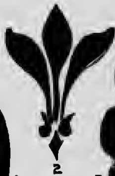
1 2 3 Greek Anthemion