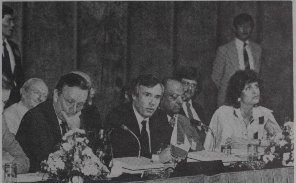
Dr. Mark MacGuigan (centre), accompanied by the Canadian delegation, speaking to his ASEAN counterparts at the Post-Ministerial Conference.