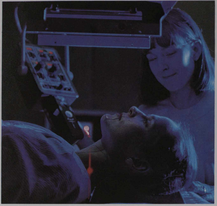
Scanners can eliminate the need for risky surgery.

The firm also produces biomedical devices which monitor heart beat and an 'electronic gym' which measures the electrical activity of various muscle groups during isometric exercise.