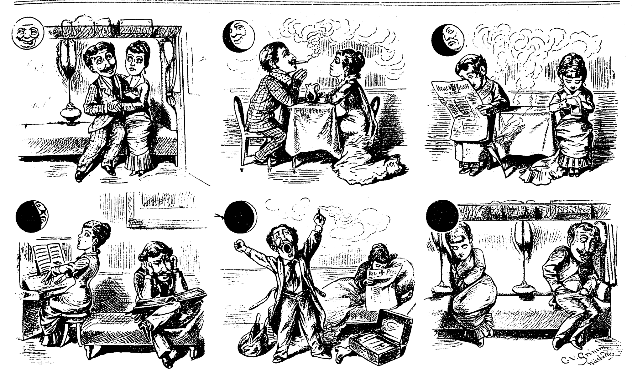
THE HONEYMOON, IN SIX PHASES .- By E. GRIMM.