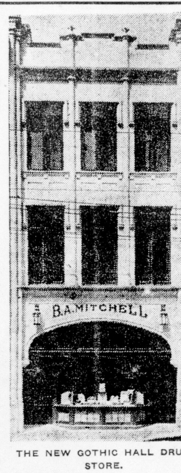
THE NEW GOTHIC HALL DRUG STORE.