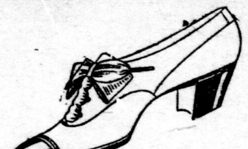
Tan Russia Calf Blucher Oxford, Extension Soles, Military Heels, $1.48

Your only chance of missing a bargain is to stay away. Come with the hundreds of others and swell the throng of pleased buyers. Never before have we offered such a clean, up-to-date lot of Shoes at such ridiculously low prices. This ad. indicates only a portion of the surprises we have in store for you.