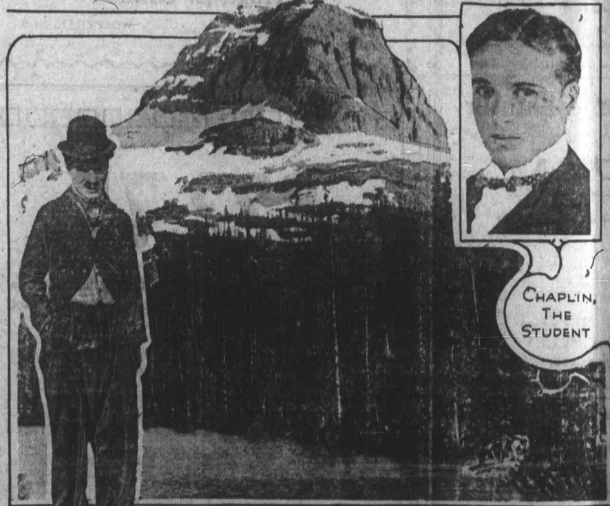
CHARLIE, THE CUT-UP