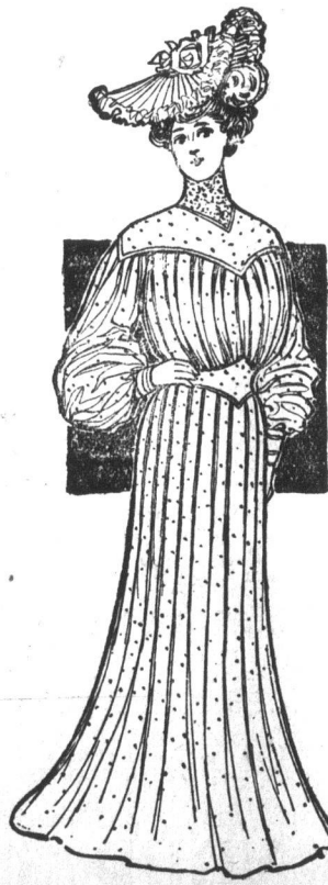
ROSE MUSLIN GOWN.

Rose is one of the favorite Parisian shades. A very smart afternoon gown seen recently was in soft white china silk decorated with a border of silk covered with pink spots. The skirt was caught up on the hips in pannier fashion, while the bodice was finished with a fichu of black embroidered sole de