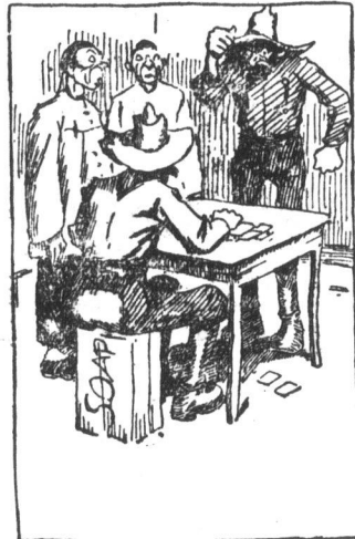
"JUSTICE! JUSTICE! JUSTICE!"