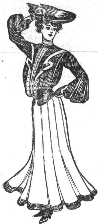
BERGE YACHTING COSTUME.

Serge is Always Useful—Rough White Hopsacking Skirts. Yachting costumes are among the considerations of the moment. French women are having a great deal of deep crimson serge made up in this way. The average woman, however, looks best in a costume of navy blue trimmed with touches of red or white. Costumes of white serge and brilliantine are also smart trimmed here and there with touches of dull green. A blue yachting costume seen recently was of blue serge decorated with