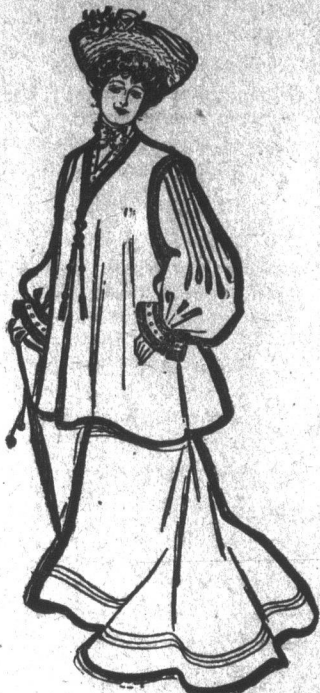
A USEFUL COAT.

Tinted laces of all shades are prime favorites for evening gowns. Cunning little cravats of satin folded around the neck and finishing in fringed ends are popular this spring. Pelerine capes will be much worn. These are of plaited taffeta trimmed