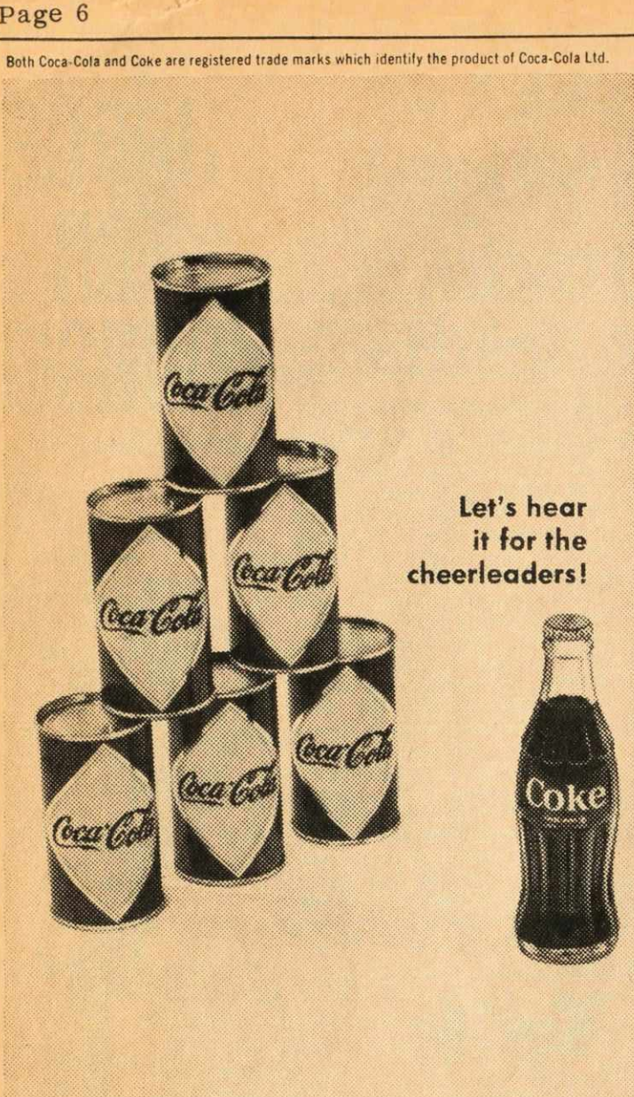
Everybody cheers for ice-cold Coca-Cola. Coke has the taste you never get tired of ... always refreshing. That's why things go better with Coke . . . after Coke . . . after Coke.