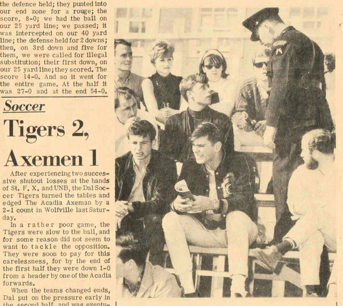
The arm of the law, a member of local constabulary, asks to see a bottle during recent football match at Studley Field. It's contents were non-alcoholic and the policeman was promptly booed from the grandstand.