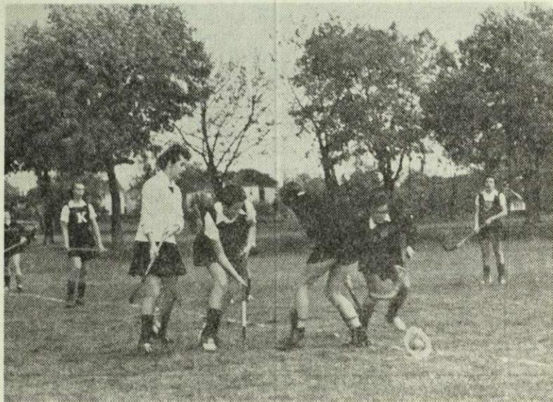
Shown above are members of Dalhousie and Kings hockey teams in the midst of a struggle for the ball...