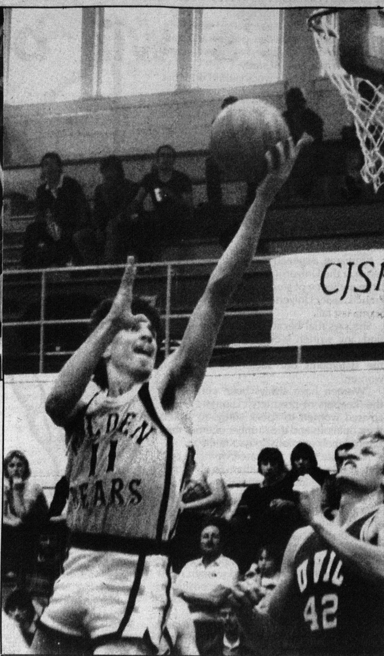
pro-ball tryouts. If not, he still needs

The support that the Bears get hasn't helped. "School spirit at the UofA leaves a lot to be desired."