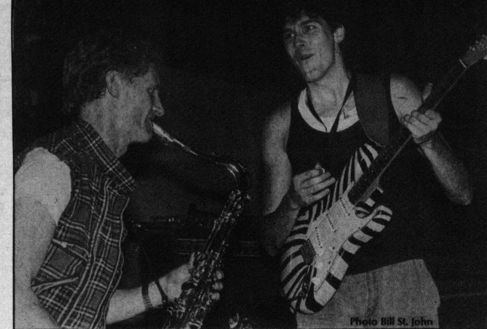
Saturday night the Villains played to a packed house at Dinwoodie. The crowd was awed by three exter sax and drum solos as the power failed but the band never missed a note. Each time the lights went out the stage was stormed by delighted fans.

The Alberta Ballet Company will be premiering Coppelia April 16 and 17. ABC's next Edmonton performance is their annual production of The Nutcracker, December 26 through 28.