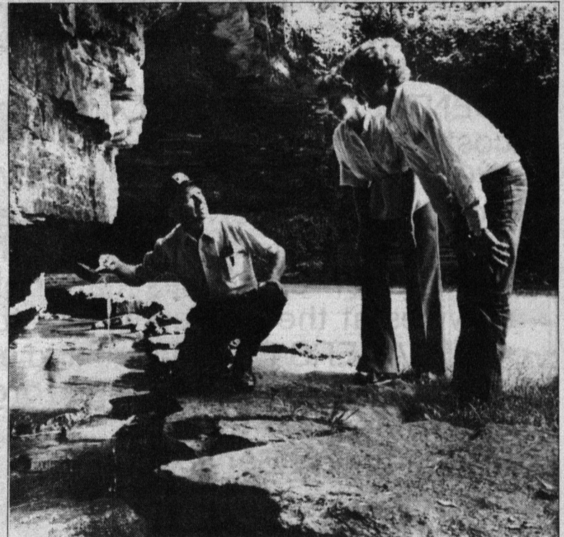
Jack Daniel Distillery Named a National Historic Place by the United States Government

AT THE JACK DANIEL DISTILLERY , you can taste for yourself why our whiskey is so uncommonly smooth.