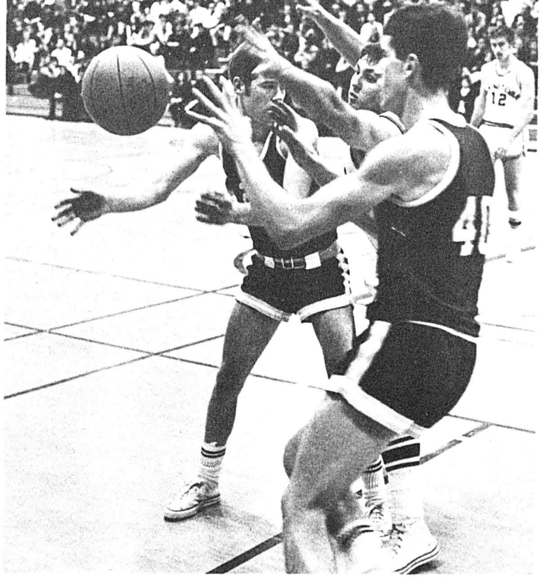
BALL, BALL, IN THE AIR