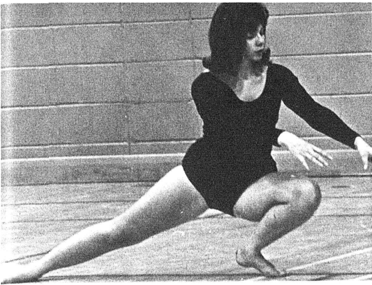
SIX POSITIONS OPEN ... on women's gymnastics team