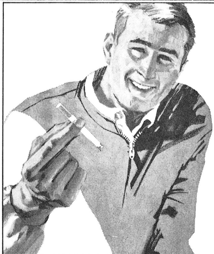
The Player's Jacket—fashioned by BANTAMAC in Terylene*, a Cel-Cil fibre. *Reg'd. Can. T.M.

Both Coca-Cola and Coke are registered trade marks which identify only the product of Coca-Cola Ltd.