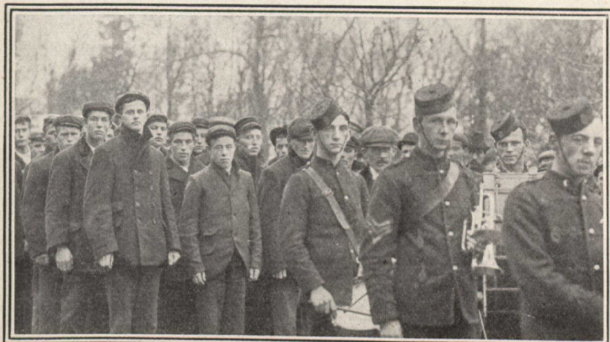
A Line-up of Naval Reserve Recruits at St. John's,