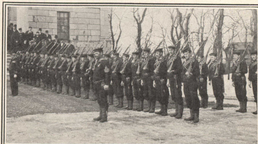
Naval Reserves Acting as Guard of Honour at the Opening of the Legislative Assembly, at St. John's.