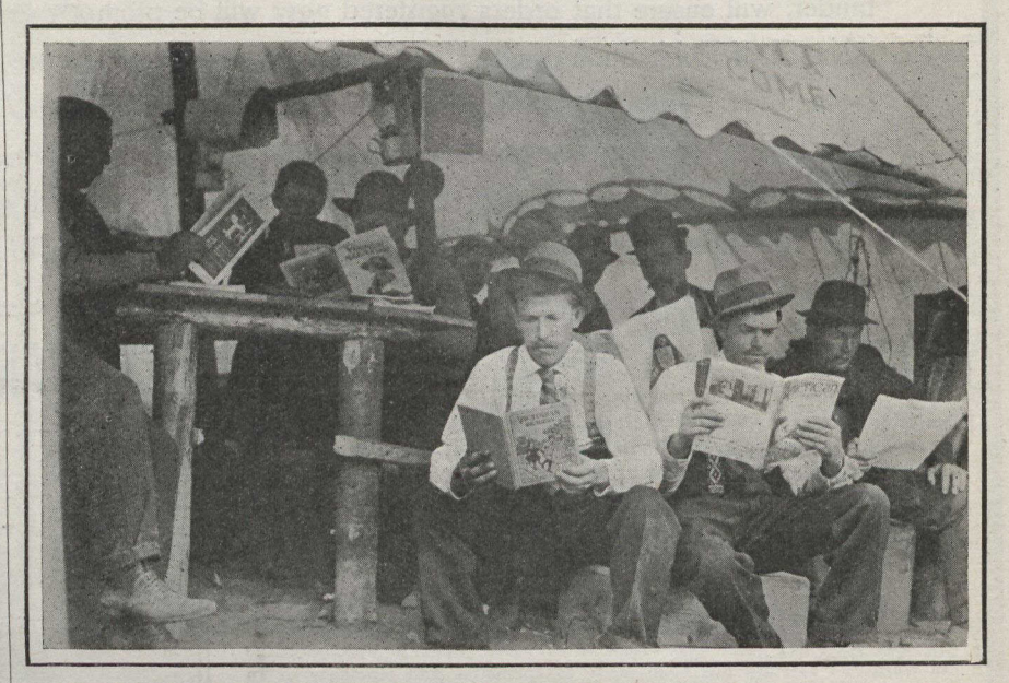
Grand Trunk Pacific workmen at Mileage 6, Yellow Head Mountains, B.C., keeping up-to-date through the magazines supplied by the Reading Camp Association.

sideration just now. An act has been drawn up and submitted to the Provincial Government for endorsation.